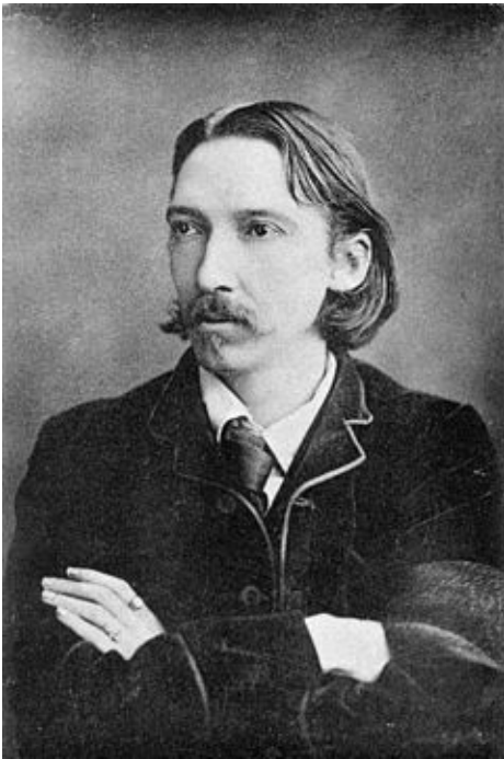
Author Robert Louis Stevenson

Robert Louis Balfour Stevenson (13 November 1850 – 3 December 1894) was a Scottish novelist, poet, essayist and travel writer. His best-known books include Treasure Island , Kidnapped , and The Strange Case of Dr Jekyll and Mr Hyde .