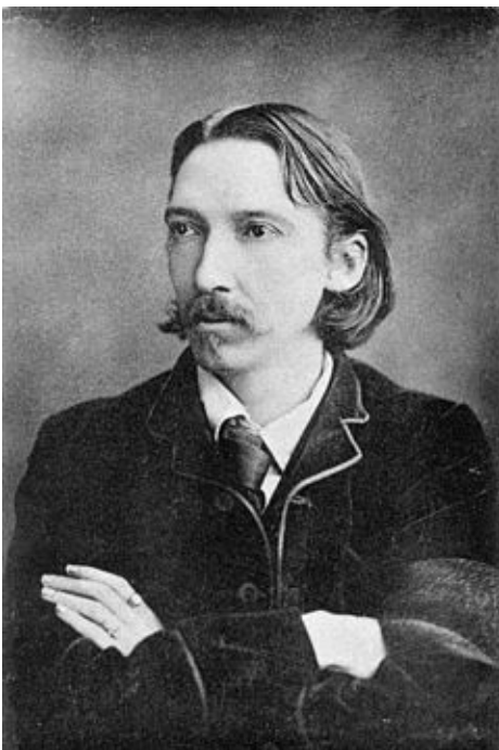
Author Robert Louis Stevenson

Robert Louis Balfour Stevenson (13 November 1850 – 3 December 1894) was a Scottish novelist, poet, essayist and travel writer. His best-known books include Treasure Island , Kidnapped , and The Strange Case of Dr Jekyll and Mr Hyde .