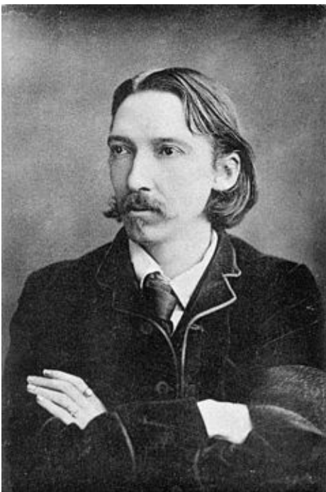
Author Robert Louis Stevenson

Robert Louis Balfour Stevenson (13 November 1850 – 3 December 1894) was a Scottish novelist, poet, essayist and travel writer. His best-known books include Treasure Island , Kidnapped , and The Strange Case of Dr Jekyll and Mr Hyde .