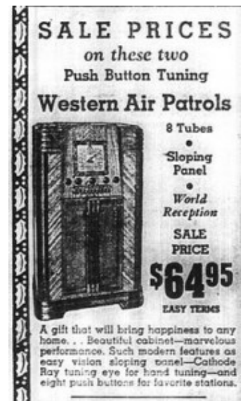
Fig. 1. Western Auto Air Patrol Model.

Let's say you purchase the Western Auto "Air Patrol" model pictured in Figure 1. You restore it, get it working great and decide to put it on the open market. You can see that it's original selling price was $64.95. You decide the value of your restoration is worth ten times that much, so you set the price at $649.50. Well, let's round it up to $650. You might come across someone who wants it to set in their foyer as a conversation piece who might offer $200. Then again, you might find someone who just can't live without every model of the "Air Patrol," and you have the one model he hasn't been able to find. You might get $700 out of him.